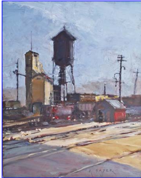
East Ely Yard is a 9 x 12 Oil on canvas painted on-site by April Raber.

On Saturday, September 3rd the grounds will be open 6:30am - 8:30pm for painting and photogra-