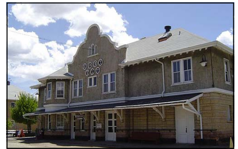
High ceilings in the Nevada Northern Railroad Depot in Ely, NV provided an early form of comfort control that constituted energy saving at the beginning of the 20th century.

Park Service sources report that more and more developers think "sustainability" when they consider historic preservation projects today. The Service believes it makes sense from a couple of perspectives. Historic preservation projects generally have a lighter carbon footprint. They also make great economic sense when a project qualifies for the National Park Service's program that confers a 20 percent federal tax credit for